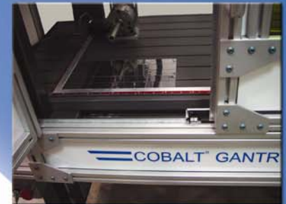
Optional Rotary Axis Shown