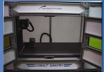
Marking Area: 24" x 48"

Rotary Axis Fume Extractor 254 FL Lens 100 FL Lens Robot Loaders Conveyor Systems Rotary Axis Full Integration For Production / Assemblies